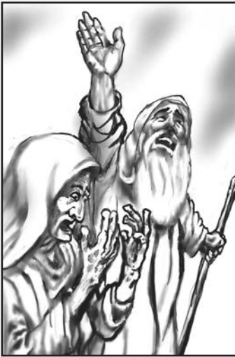
Moses asked God to heal his sister.

Imagine in your mind that you are Moses, and you are talking with God. What do you think Moses felt, saw, and heard? You may wonder why the Israelites didn't want to talk with God in this personal way. They asked Moses to go to God for them and then come back and tell them what God said (Exodus 20:18–21). When Moses prayed, he asked God for advice. Moses also went to God to get help for the Israelites.