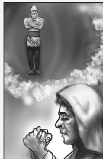
Daniel asks God to show him the secret of the king’s dream.

How does Daniel’s story show you that we have no good reason not to pray?