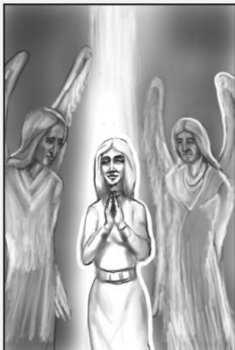
God sends angels to our side when we pray.

When we kneel, we show that our hearts are empty of all pride. For sure, we can pray when we sit in a chair or lie in bed. But when we kneel, we show that we are ready to serve God with all our hearts. Our bodies and our words announce that God is in control of heaven and earth, and that we are His children.