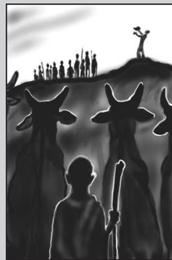
Rompas followed the cows to an outdoor religious meeting.