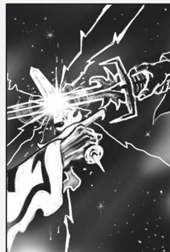
Lucifer's doubts about God caused war in heaven.

What are some false ideas or beliefs about God that we are taught in this life? Are there times in the past when your behavior showed people a false "picture" of God? If yes, what can you do to change with the Holy Spirit's help? How can you show God's love to the people around you?