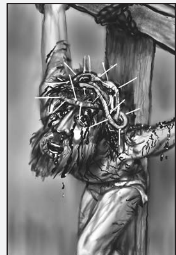
Because Jesus died to save us, He won the fight against sin and its penalty.

What things in your life now separate you from God? Ask God for the strength to help you give them up.