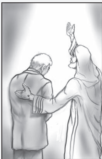
Jesus’ death on the cross helped God to accept us again.

Paul also talks about “a secret that God hid from everyone before now” (Colossians 1:26, EASY). What is this secret? What else does this secret include? How is this “secret” connected with the Good News about Jesus? This week, we will study the answer to these questions.