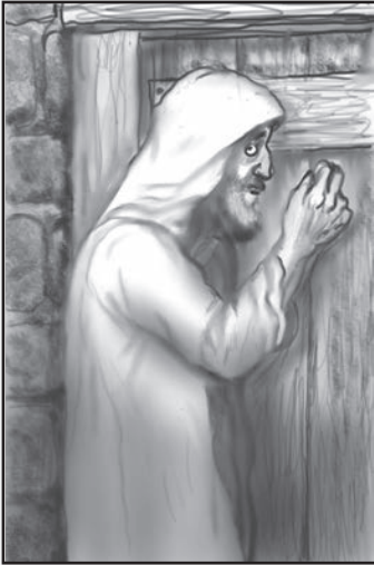
Peter continued to knock at the door after Rhoda left it locked.

Read Colossians 1:23. What encouraging words does Paul write to the Colossian church in this verse? How do these words give hope to Paul's readers? (Also read Colossians 2:5 and Ephesians 3:17.)