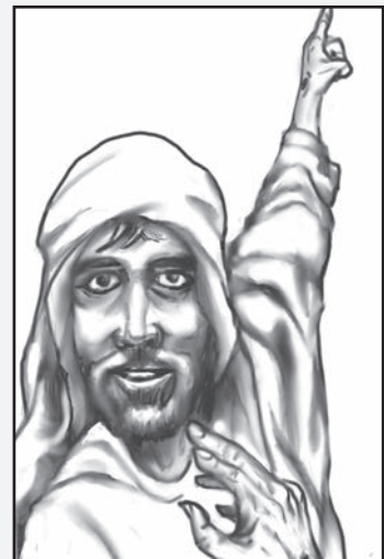
Jesus helps us to “see” the invisible God.

Again and again, Jesus also uses God’s name to talk about Himself. God is the “I AM” (read Exodus 3:14, ERV). Jesus says, “ ‘I am the light’ ” of the earth (John 8:12, ERV). “ ‘I am the good shepherd’ ” (John 10:11, ERV). (Also read John 10:14; John 11:25; John 14:11; and John 8:58.)