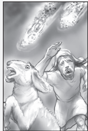
Overnight, disaster hit Job and his family hard.

What hope do we as Christians have in our sufferings?