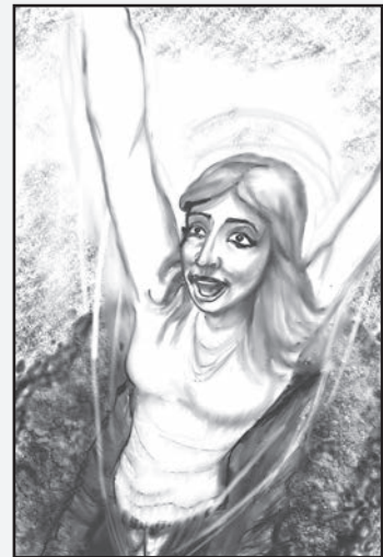
The dead rest in the grave until Jesus wakes them up.

Paul was ready to die for Jesus. But he knew that his staying alive would be better for the Philippians than his death (Philippians 1:24). Is it better for us to live for Jesus or to die for Him? This question isn’t easy to answer. Paul said, “I can’t decide between the two” choices (Philippians 1:23, NIV). Both choices “seem very good to me” (Philippians 1:23, EASY).