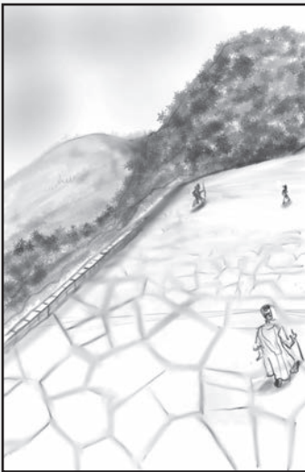
The Roman roads made travel and communication easy and fast.

What three things does Paul thank God for? Read Colossians 1:3–8 for the answer.