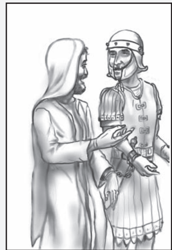
Paul saw his Roman guards as possible members for God's kingdom.

What are some bad experiences in your past that made your faith strong? How else did these experiences help you grow? How did they help you trust God more?