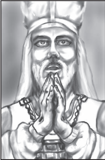
Jesus goes to God for help for us today.

God's promises to Israel depend on if the people obey. They won't enjoy success if they don't obey God. That's because success is always connected with their obedience to Bible truth. The land is proof of God's love for His people. The land shows that God keeps His promises (Nehemiah 9:8). As long as the Israelites continue to obey God, God will give them the rest of the land. Will the people hold on to what God already gave them?