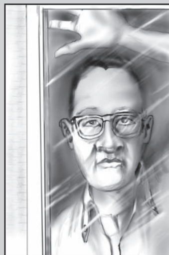
Baatka looked out the window and hoped for a real friend.