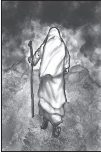
Moses approached the thick, dark cloud that hid God (Exodus 20:21).

What did Moses ask the Lord to teach him? Why did Moses want God to lead them in a visible way? Read Exodus 33:12–17 for the answers.